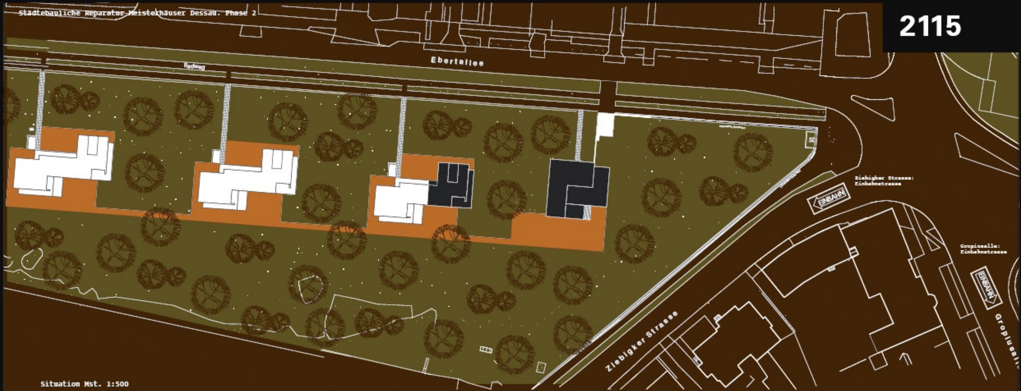
Situation Mst. 1:500